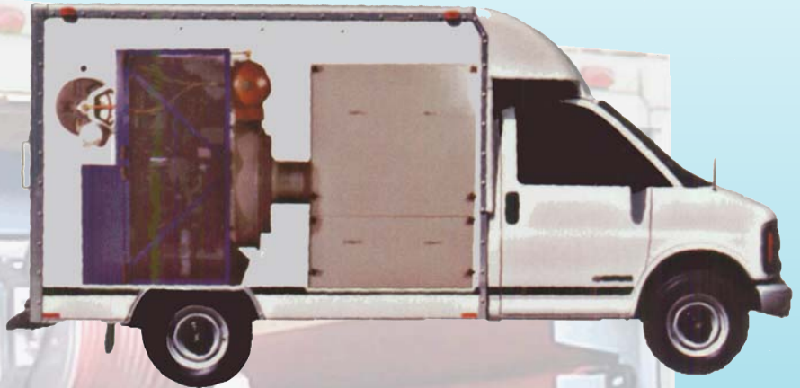
Truck Air Duct Cleaning Setup

3 Stage Filter Box Assembly 13 Cubic Foot Dust Collection Box w/ Trays 4 Bag Filters V Bank w/ Dual 36” x 24” Pleated Filters